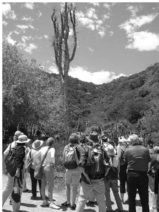
Participants admire the Boojum tree ( Idria columnaris) at the Wrigley Memorial and Botanical Gardens, Catalina Island Post-Conference Tour

Mexican and California fan palms, boojums, agaves, coast redwood, and ginkgo were among the plants that served to highlight the diversity of this Garden's flora.