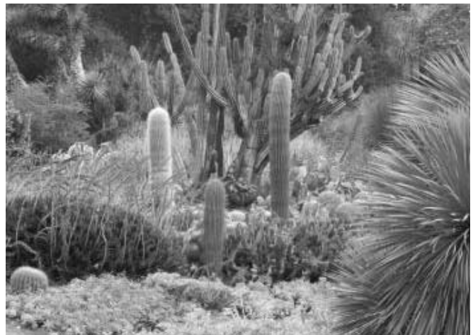
Sonora Desert plants in the Huntington Garden, photo by Gayle Bradbeer.

The guides took us through the North American section and greenhouse of the desert or succulent garden where we were treated to views of some plants over a hundred years old and a large number of cacti in bloom. The tour also included the water lilies, bamboo, and some of the palms.