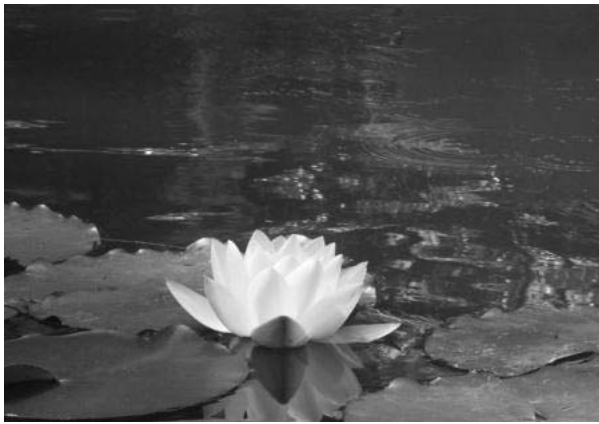
Water Lily at the Huntington Botanical Gardens.

The head of the photo conservation studio showed us their new-sophisticated equipment. Among many new capabilities, the staff is now able to produce images of large items, such as a large carpet, which was being digitally photographed. The resulting information will be used for study, documentation, and inventory purposes. We were then shown how the images could be enhanced, manipulated, and studied on a computer.