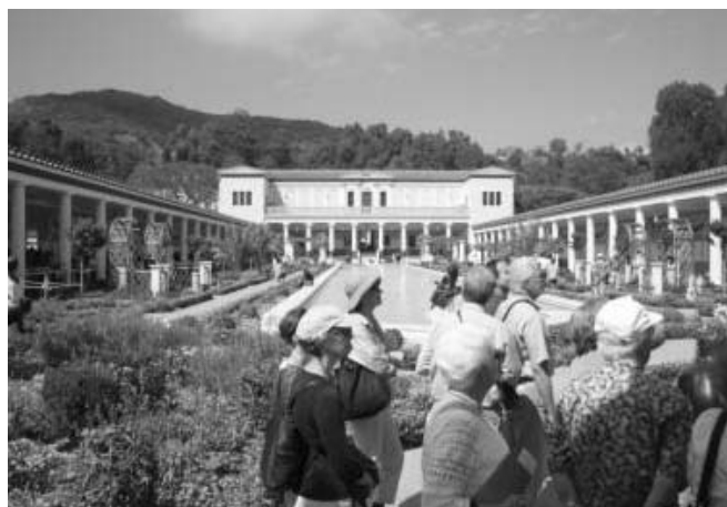
Gardens at the Getty Villa, Malibu, Post-Conference Tour