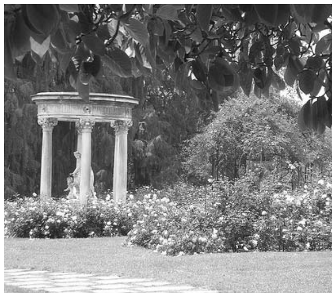
The Huntington Garden

The Library’s new Munger Center is provided with a high-level security system and compact shelving. It houses the Reader Services Department, classrooms, carrels for long-term scholars, and the new spacious state-of-the-art conservation facilities. We made a brief stop in the paper and book conservation studio, but no one was available to talk to us.