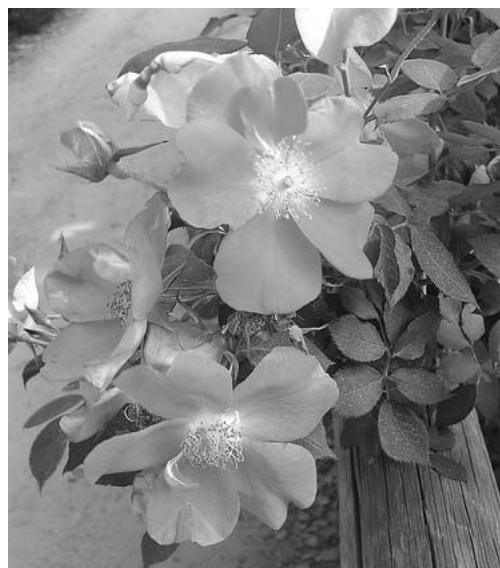
Wild California rose at Rancho Santa Ana Botanic Garden

Botanic Garden on Thursday was like meeting a longtime pen pal for the first time. After years of hearing about this garden and its collections, dedicated exclusively to California's native plants, it was wonderful to see it live and in person. Our afternoon tour took us through the gardens, greenhouses, propagating areas, seed program, herbarium and the library. As the tour began, I found myself quickly captivated by the Chiranthofremontia lenzii in the home demonstration garden. After perusing the cultivar and home demonstration gardens, my group headed to the nursery area where plants were grown for