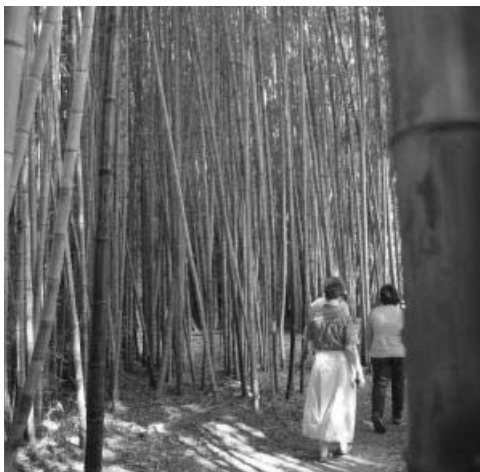
Bamboo grove at the Huntington Botanical Gardens