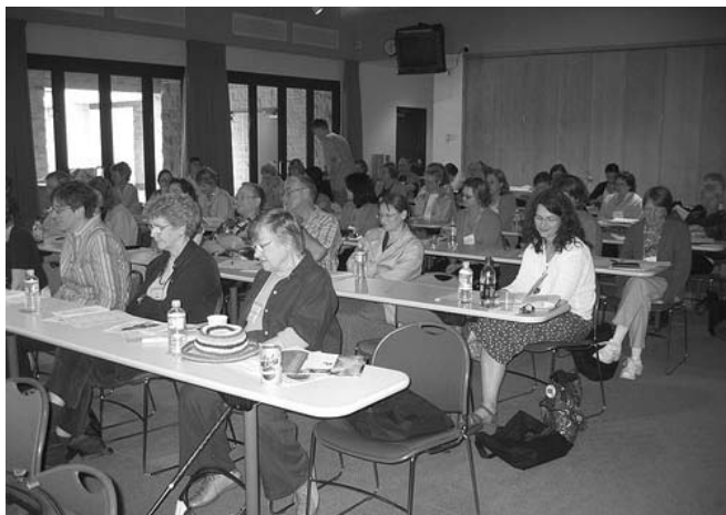
Audience at the Business Meeting