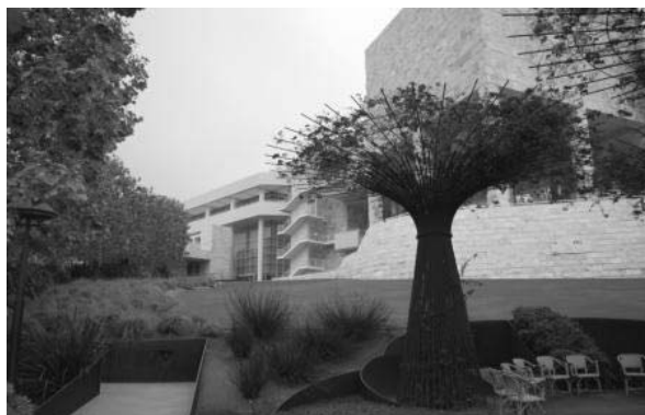
Gardens at the Getty Center, Post-Conference Tour