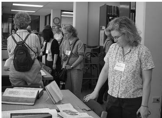
Tour of the Rancho Santa Ana Botanical Garden and Library

One of the significant pleasures of the CBHL annual meeting is touring the collections of host institutions. For me, visiting the Rancho Santa Ana