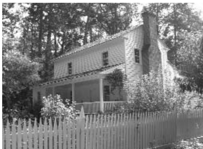
Tullie Smith Farm

The rustic 1845 Tullie Smith Farm, complete with examples of seven pre-Civil war buildings, brings the daily activities and challenges of Georgia's Piedmont-region pioneers to life. Tullie Smith House is surrounded by a separate open-hearth kitchen, blacksmith shop, smokehouse, double corncrib, pioneer log cabin, and barn. The Tullie Smith Farm interprets a historic vernacular landscape of a rural 1860 slave-holding household typically found in the upper Piedmont Georgia region.