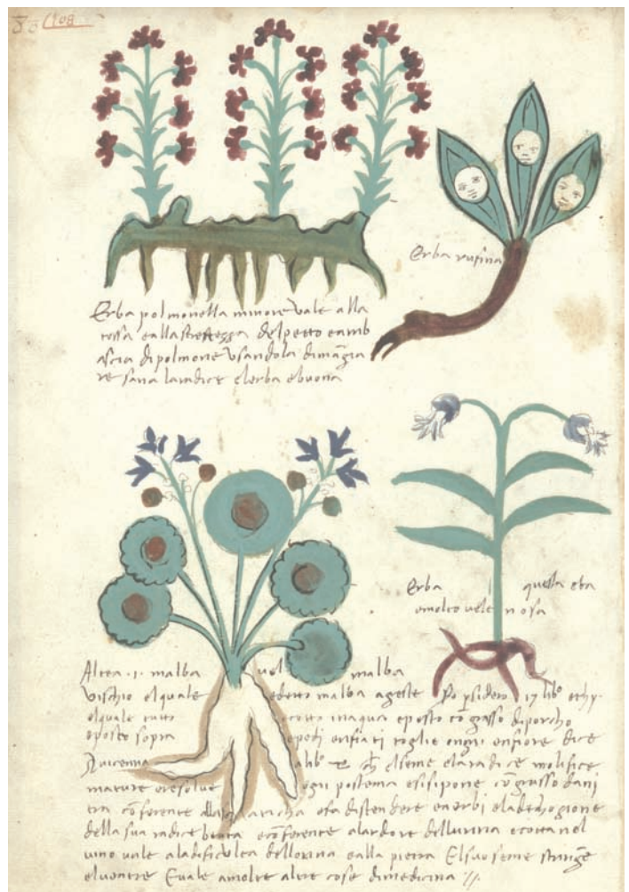
Pulmonaria officinalis (Lungwort) 'Erba Rufina' and Althaea officinalis (marshmallow) 'Omalco velenosa', from an Italian herbal circa 1500, Vermont University Library at the University of California, Los Angeles, Digital Libraries, Index of Medieval Medical Images