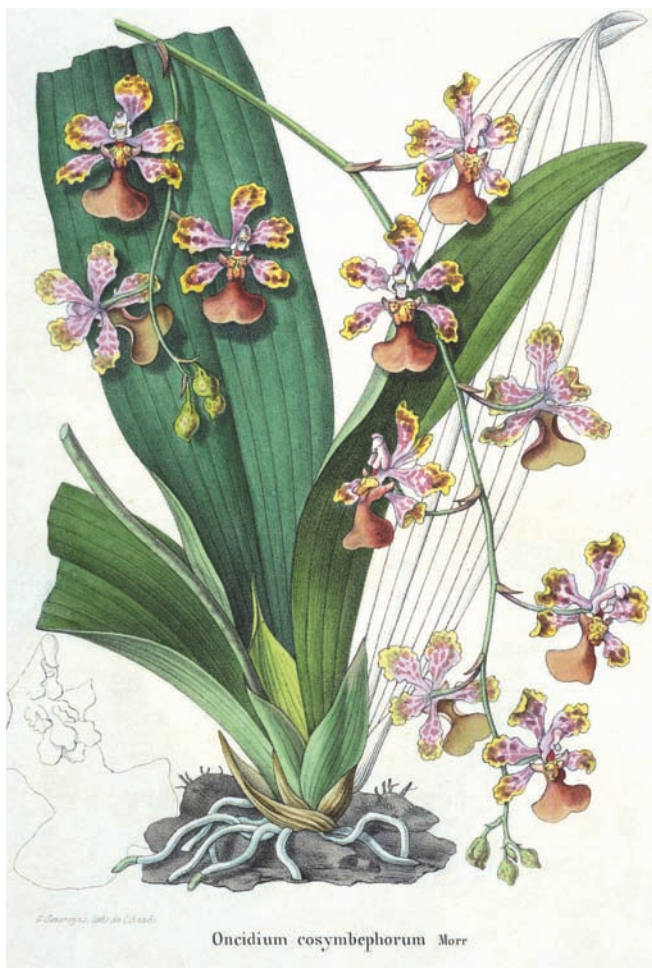
Oncidium cosymbephorum Morr