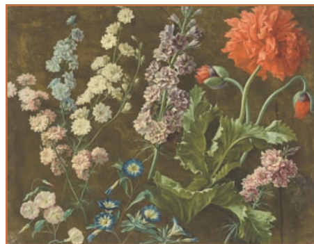
Pancrace Bessa, Liserons roses et bleus, pivoines rouges et pieds d'alouettes, oil on canvas.