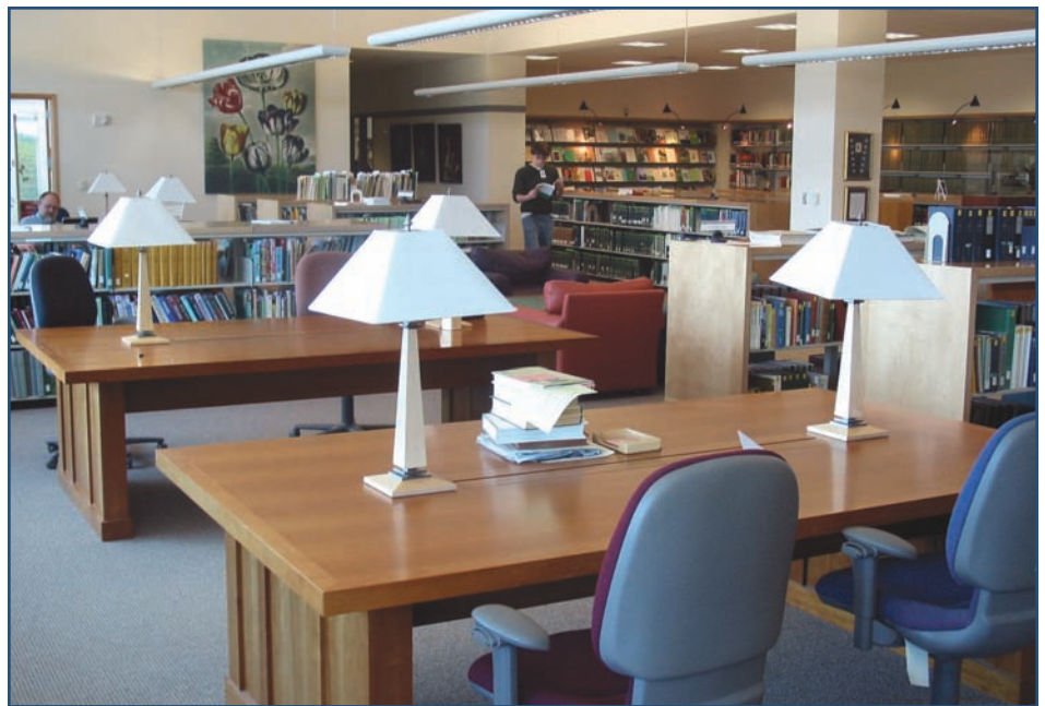
Above and below: The Missouri Botanical Garden Library's main reading room.

We look forward to hosting the CBHL Annual Meeting here in May 2009. Some of you have not visited since the last CBHL Annual Meeting hosted here in 1989. You might notice some changes! The Garden has doubled its staff size